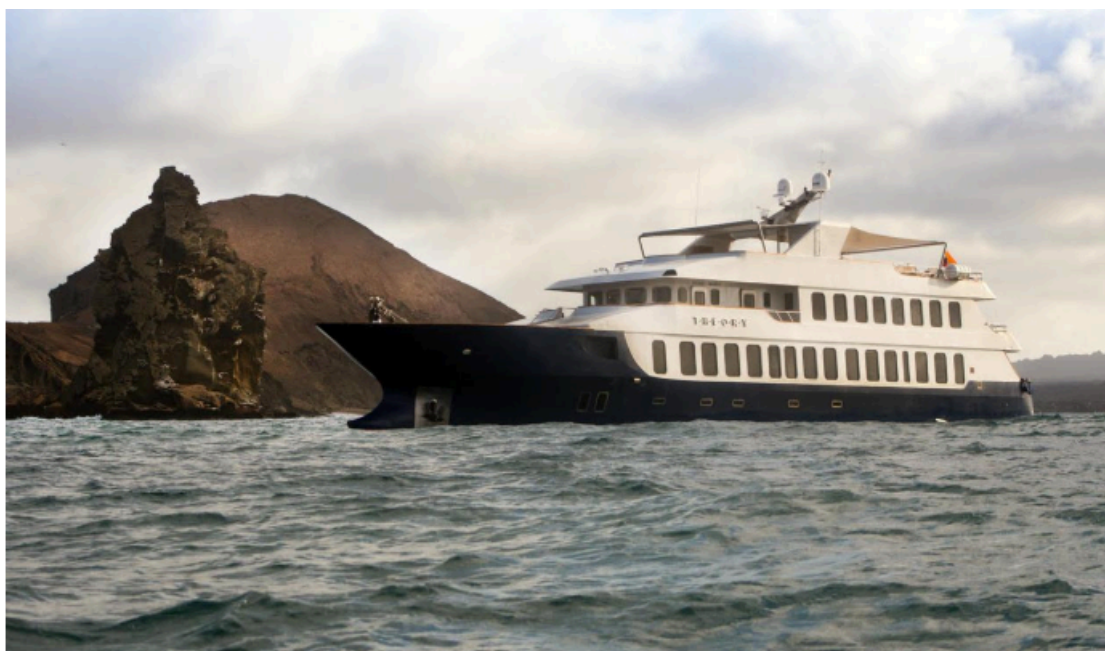
Ecoventura’s newest ship, Theory, launched earlier this month.